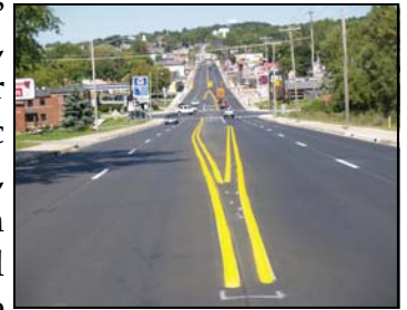
Improvements at Granite Street

After several months of construction, the 2009 Mitchell Street Improvement Project is now complete from River Street south to Granite Street. This project incorporated numerous improvements on and under the US 131 BR corridor, including underground water and sanitary sewer main upgrades, sidewalk bump-outs, new traffic signals, new count-down pedestrian signals, gateway treatments, light poles, street trees, and a "smooth riding" asphalt surface. These features add to the safety and aesthetics of downtown and were preceded by years of careful planning and budgeting.